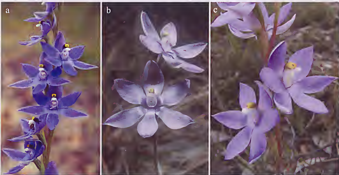
Figure 5. a. Thelymitra mocrophylla , Rocky Gully, WA (photograph by J.A. Jeanes); b. T. olpino , Snowy Plains, Vic. (photograph by J.A. Jeanes); c. T. megacalypto , Deep Lead, Vic. (photograph by J.A. Jeanes)